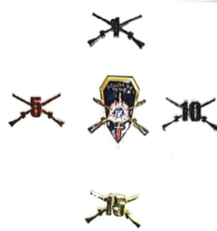
Commander-in-Chief Pin and Recruiting Pins