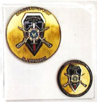
Commander-in-Chief Medallion and Coin

Below you will see examples of some of the awards and items mentioned in this program. For more information, contact the VFW Membership Department.